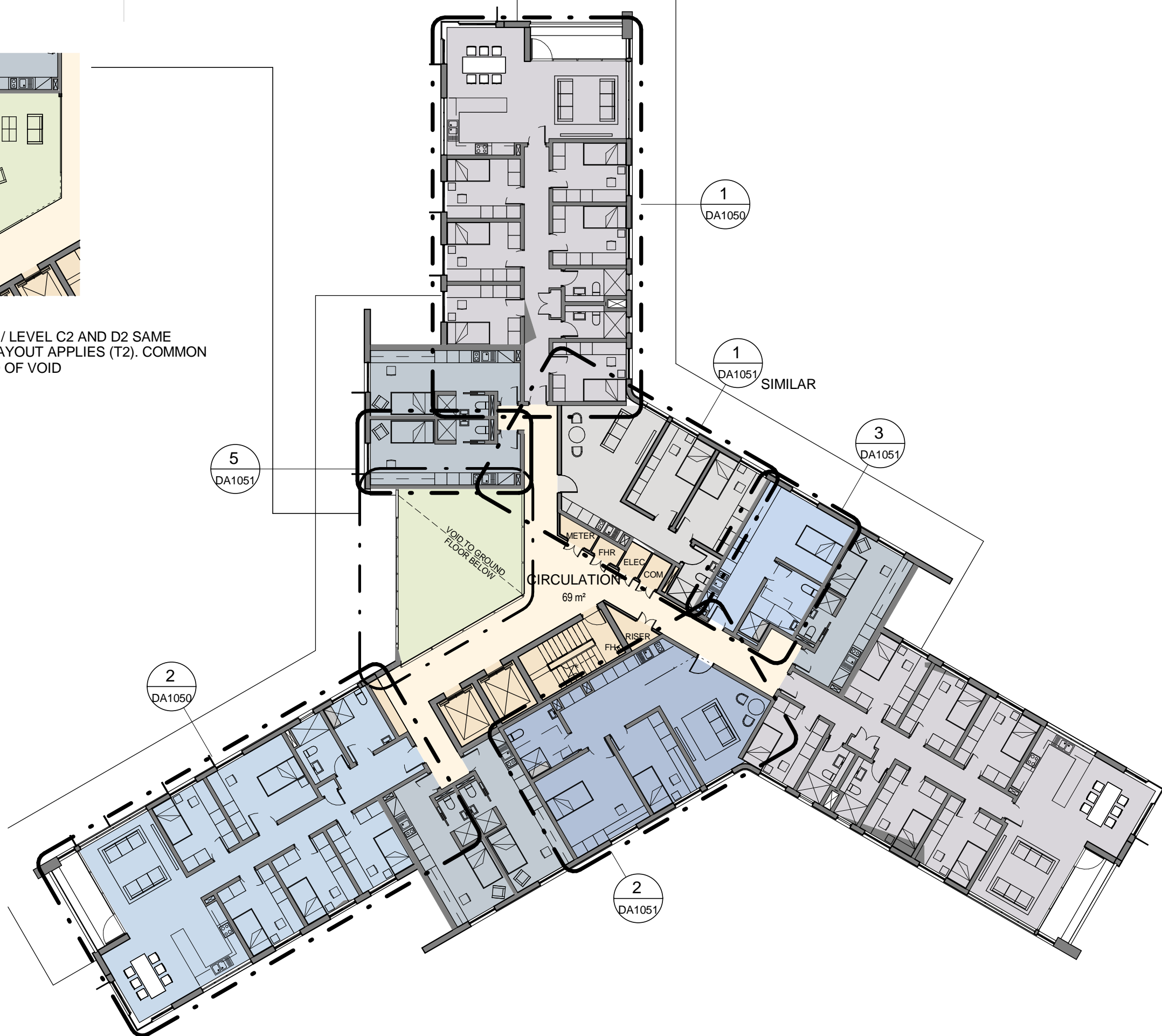
2 Typical Floor Plan - T2 (BUILDING / LEVEL A1, B1, C1, D1)