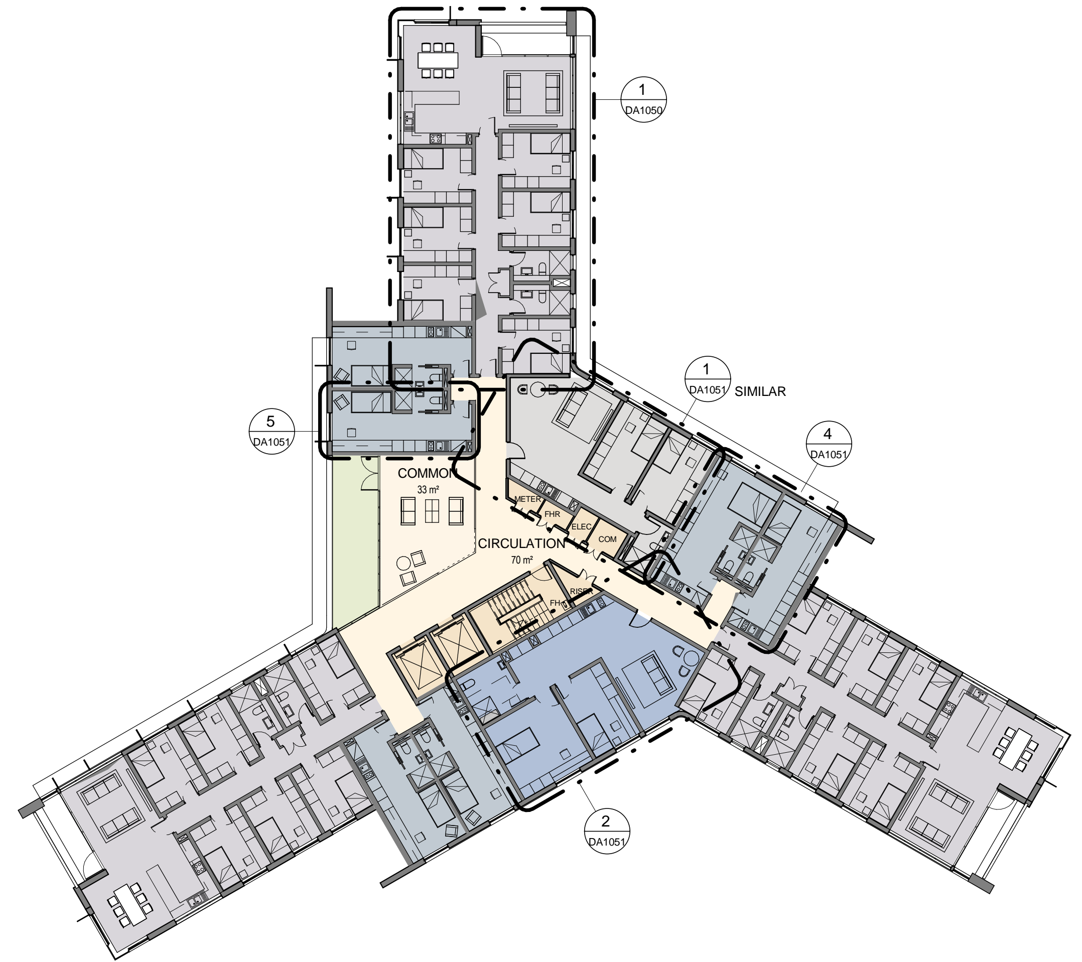
4 Typical Floor Plan - T4 (BUILDING / LEVEL A3, B3)